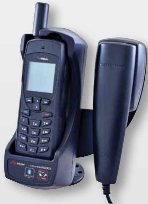
IntelliDOCK9555 with optional Privacy Handset